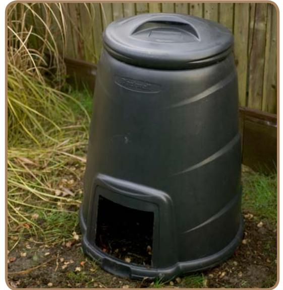
Your bin should ideally be placed on soil

Work out who is going to collect both the "green" and "brown" materials and empty them into the compost bin.