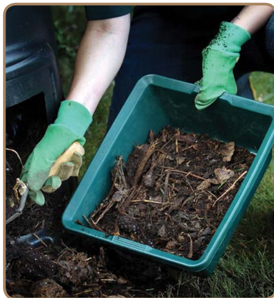
Gardening gloves should always be worn when working with compost.

While steps have been taken to ensure its accuracy, WRAP cannot accept responsibility or be held liable to any person for any loss or damage arising out of or in connection with this information being inaccurate, incomplete or misleading. This material is copyrighted. It may be reproduced free of charge subject to the material being accurate and not used in a misleading context. The source of the material must be identified and the copyright status acknowledged. This material must not be used to endorse or used to suggest WRAP's endorsement of a commercial product or service. For more detail, please refer to our Terms & Conditions on our website: www.wrap.org.uk .